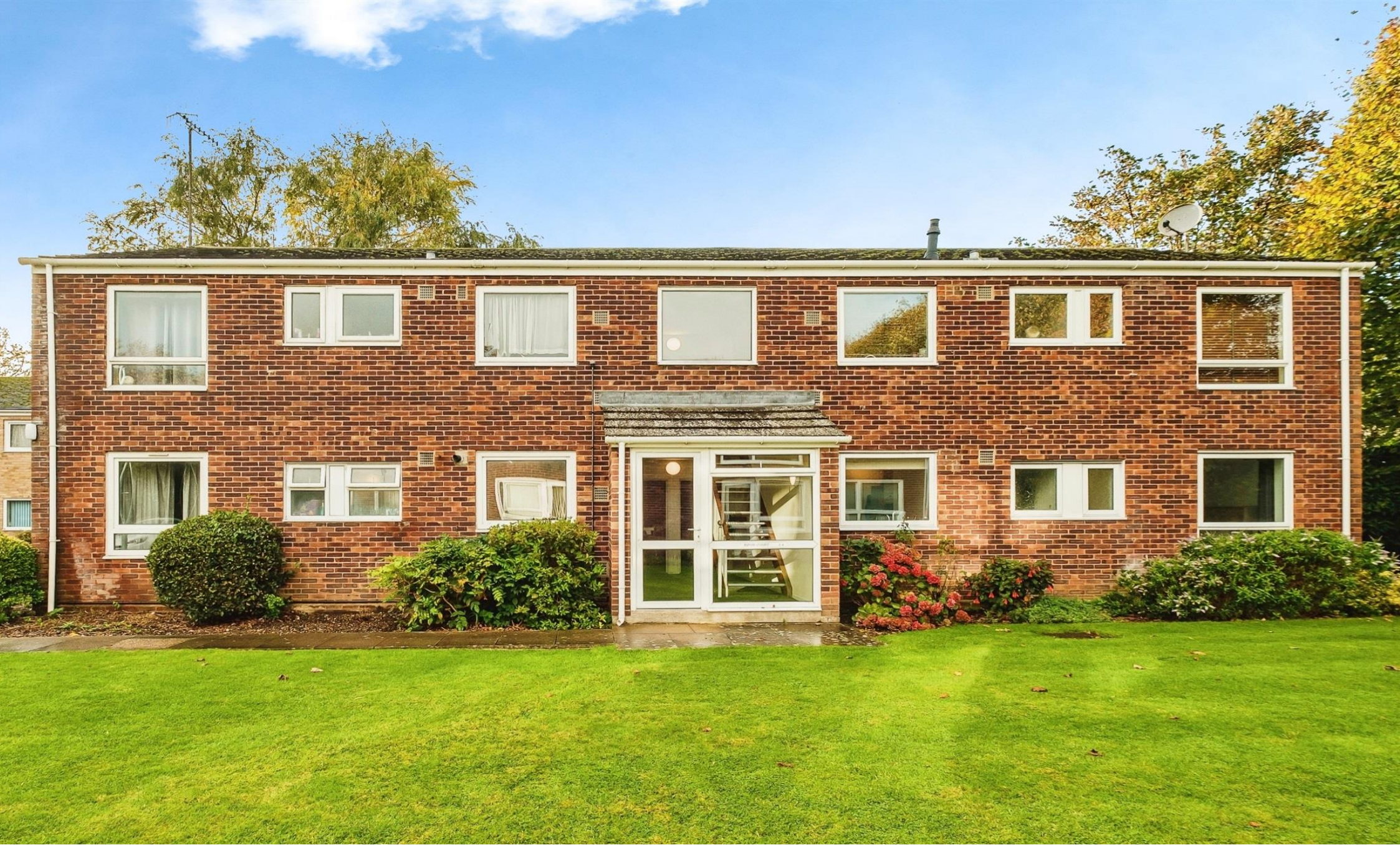
Ripon Court, Worthing BN11 5PH