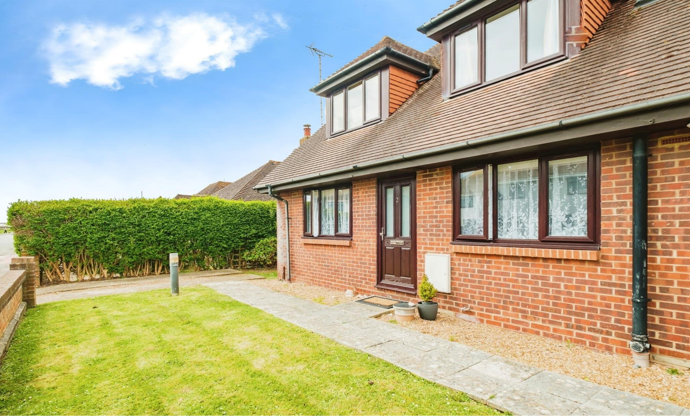
Hangleton Court, Bernard Road, Worthing BN11 5EL