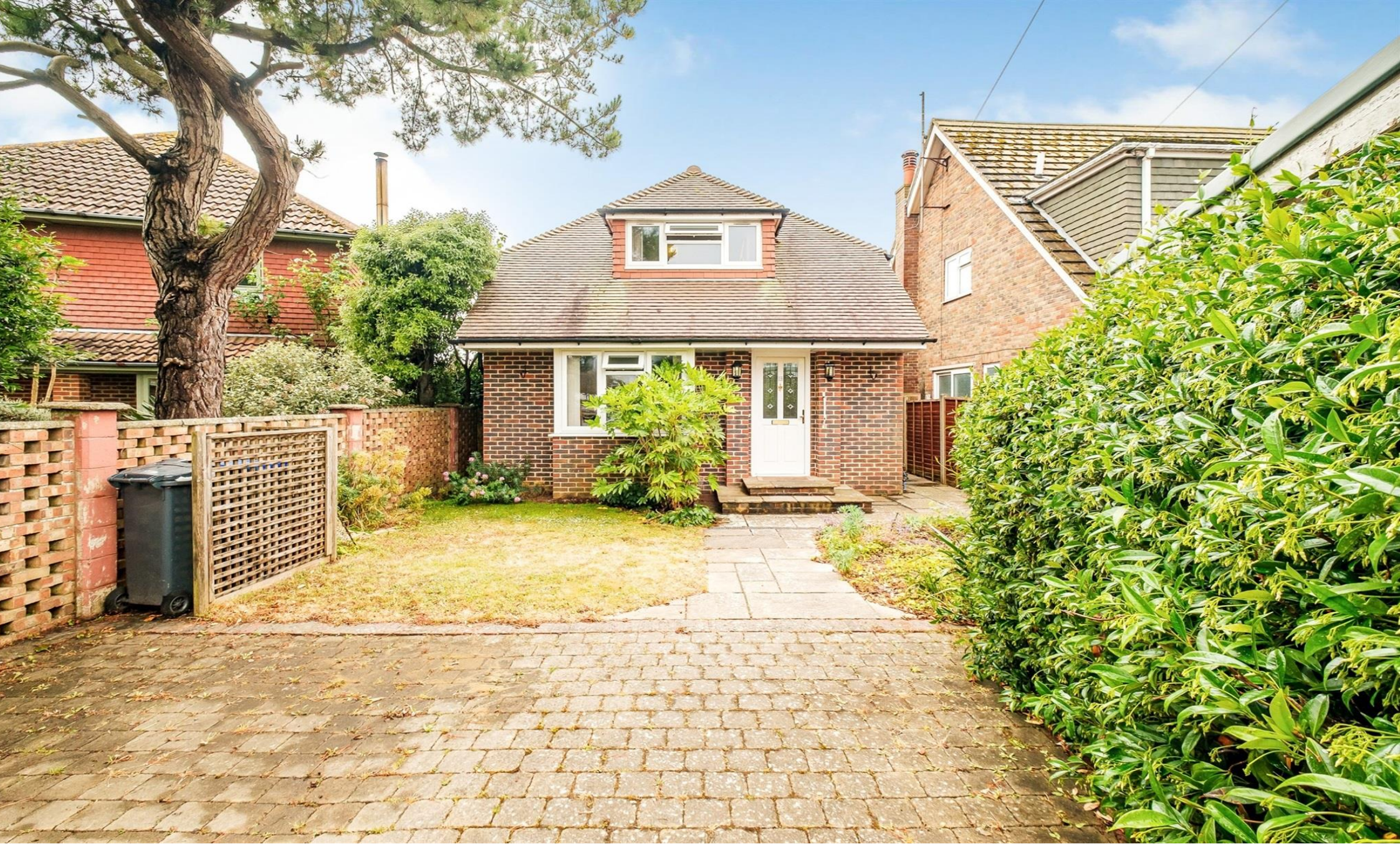
Courtlands Close, Goring-By-Sea Worthing BN12 4BT