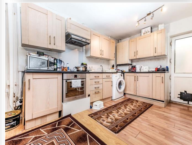
Maybridge Crescent, Goring-By-Sea Worthing BN12 6HQ