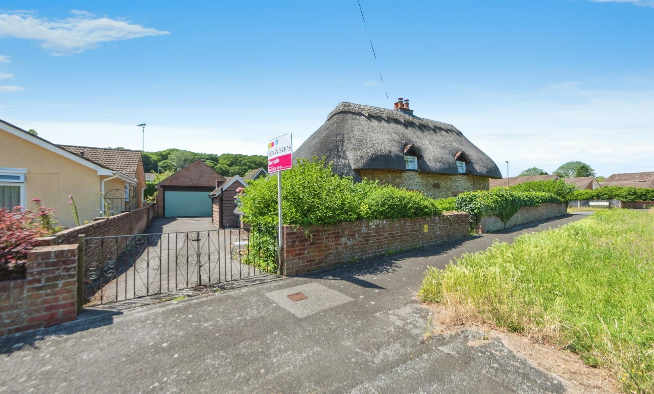
Rose Cottage, Lovedean Lane, Waterlooville PO8 9RW