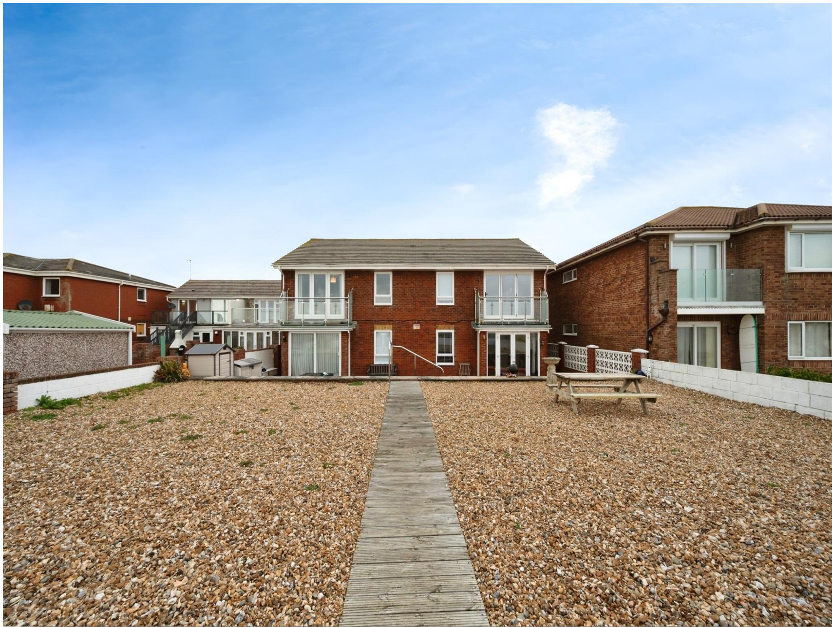
Acasta Court, Southwood Road, Hayling Island PO11 9QL