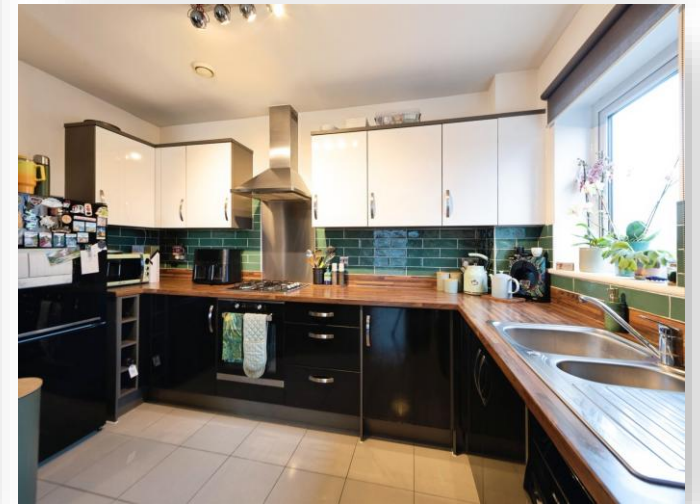
Violet Court, Foxtail Road, Waterloooville PO7 7QW