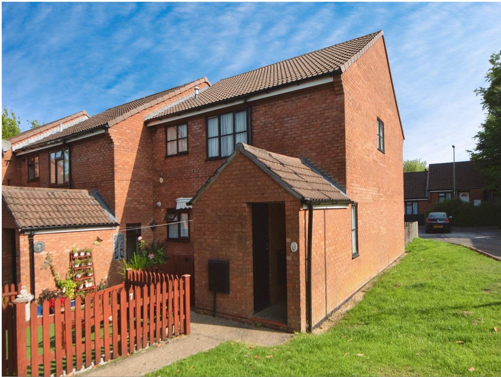
Saxon Close, Waterlooville PO8 0JT