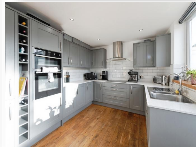
Wakefords Way, Havant PO9 5JP