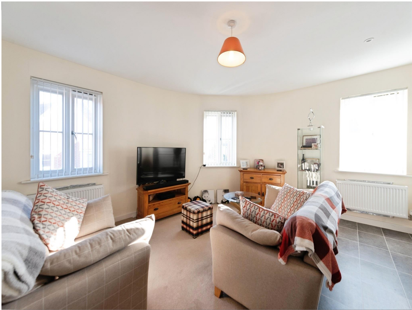
Pinnova Place, Orchard Mead, Waterloooville PO7 3AE