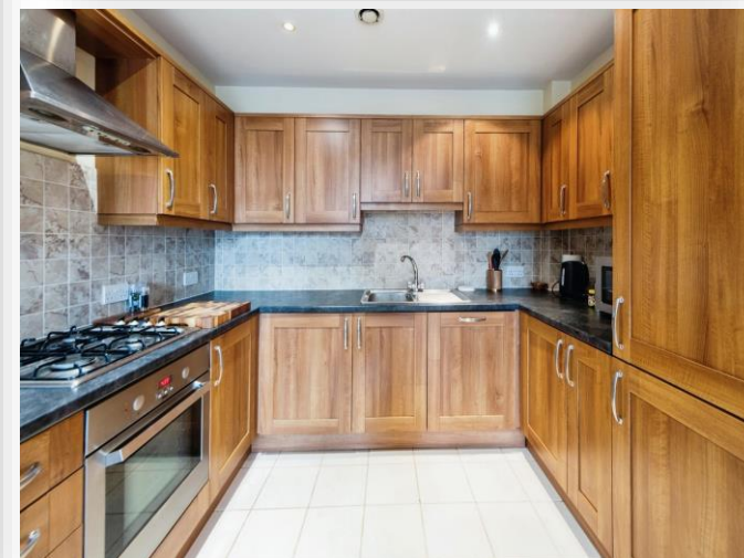
King Williams Gate, The Square, Petersfield GU32 3HP