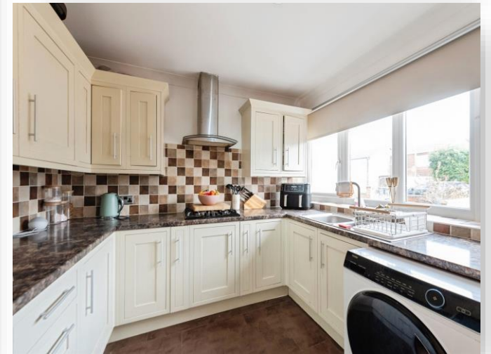
Pyle Close, Waterlooville PO8 8JN