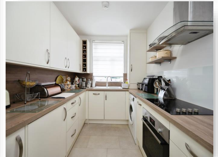
Park Avenue, Waterlooville PO7 5DW