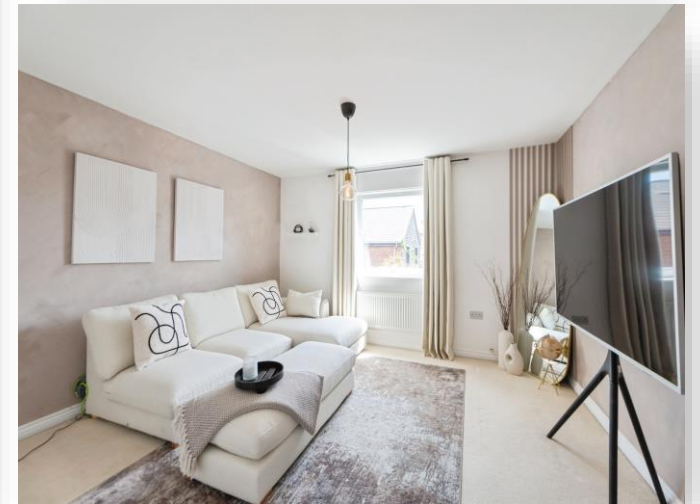
Auger Row, Waterlooville PO7 7FZ