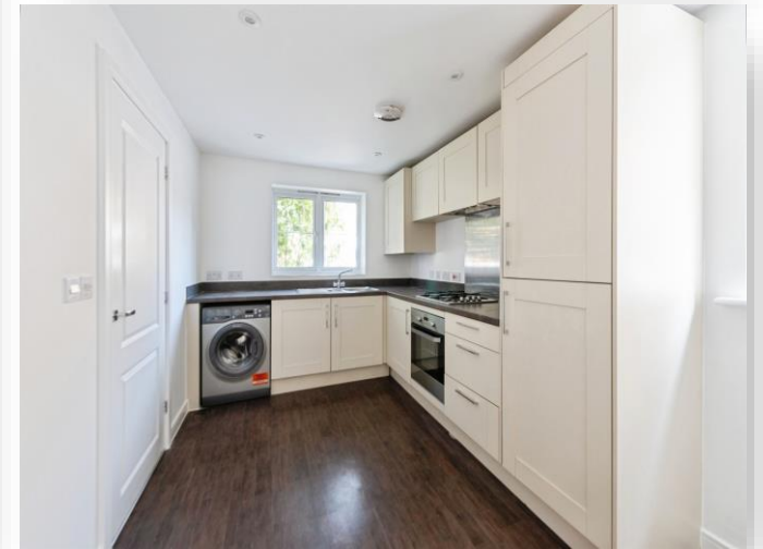
Pipits Close, Havant PO9 3FB