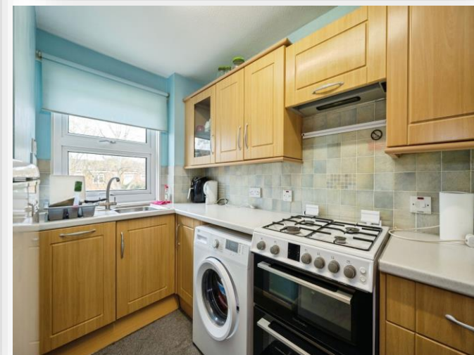
Perseus Place, Waterlooville PO7 8AN