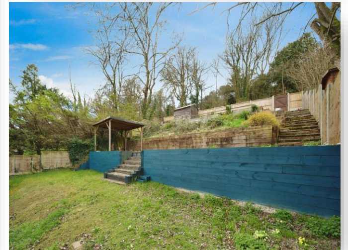
Paddock Hill, Down Road, Horndean Waterlooville PO8 0EU