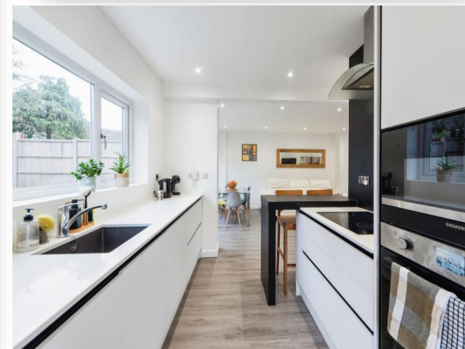
Montgomery Walk, Waterlooville PO7 5TD