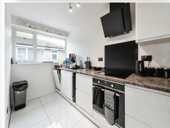
Whyke Court, Chidham Close, Havant PO9 1DZ