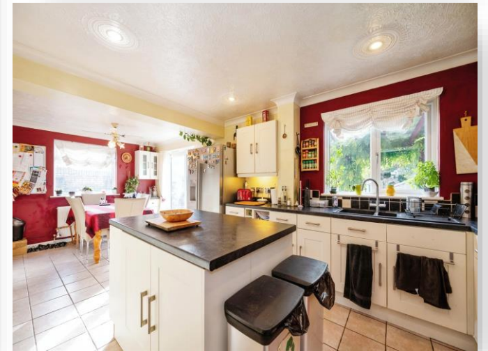
Purbrook Gardens, Waterloooville PO7 5LE