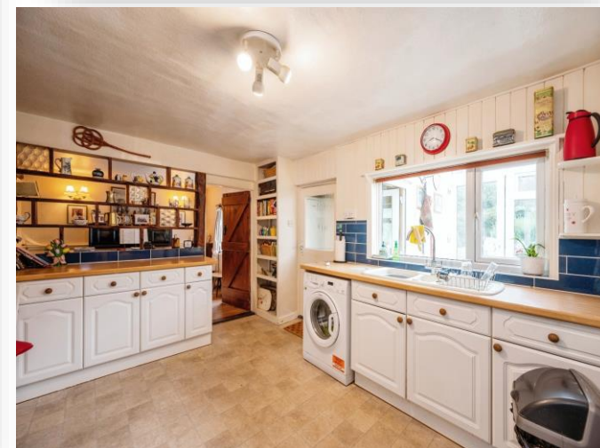
April Cottage, West Street, Hambledon, Waterlooville PO7 4SN