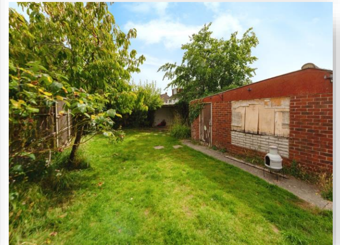
Esher Grove, Waterlooville PO7 6XG