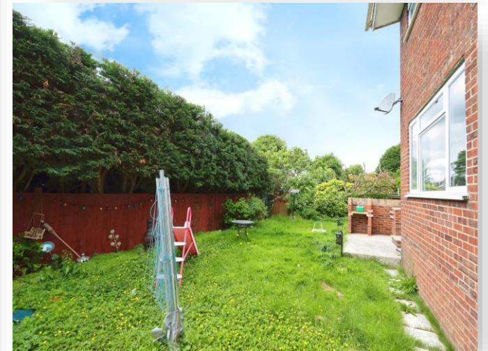
Bridefield Crescent, Waterlooville PO8 8QY