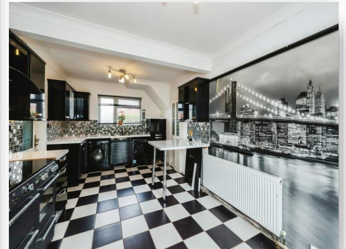
Bramdean Drive, Havant PO9 4RT