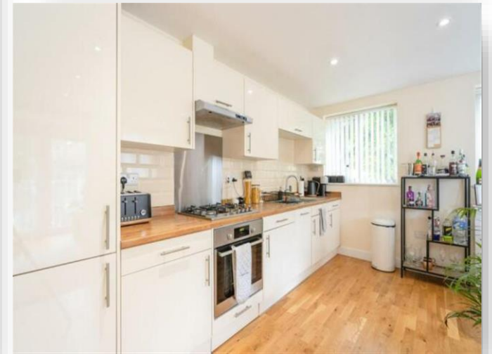
Flat C The Spinney, Denmead Waterlooville PO7 6FZ