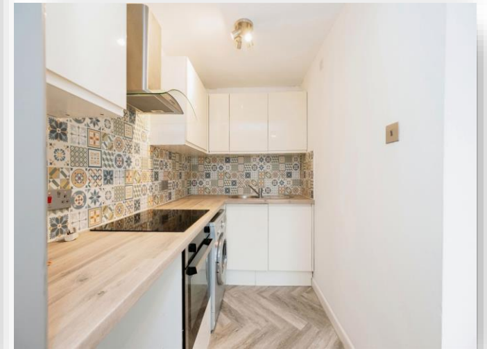
Norfolk Mews Sea Front, Hayling Island PO11 0AP