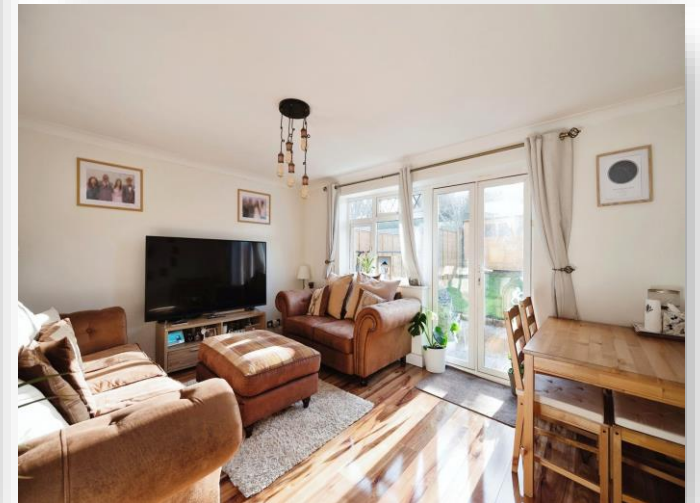
Shaftesbury Avenue, Waterlooville PO7 5UH