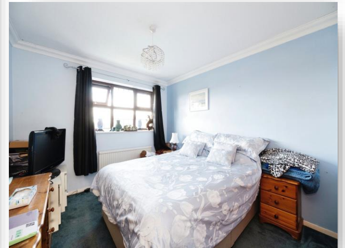
Saltmarsh Lane, Hayling Island PO11 0JT