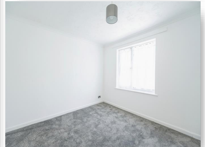
Norfolk Mews, Sea Front, Hayling Island PO11 0AP