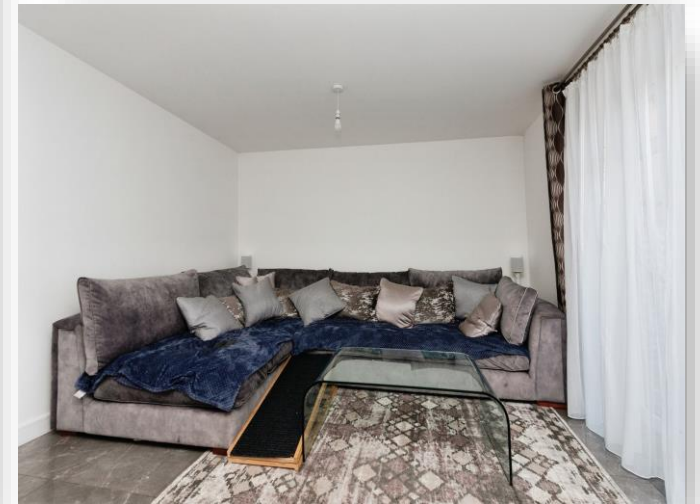
Prowse End, Bordon GU35 9FG