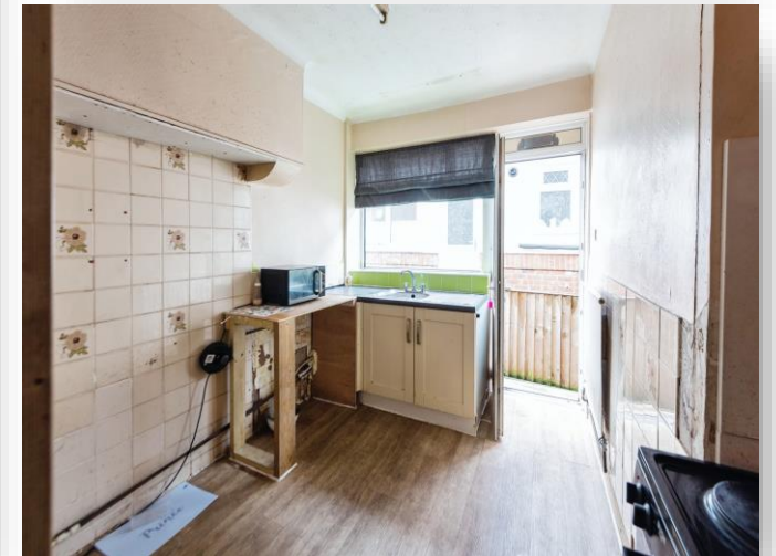
Bushy Mead, Waterlooville PO7 5DY