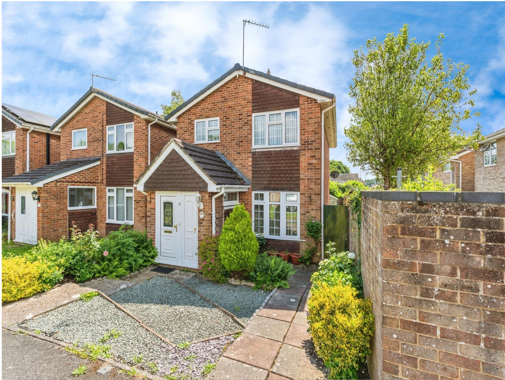
Buckland Gardens, Calmore Southampton SO40 2SB