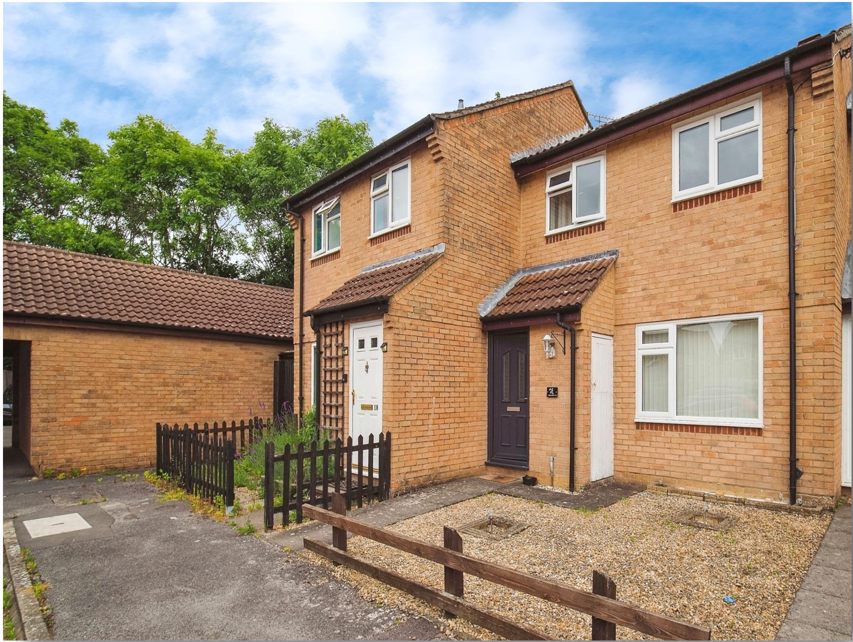
Rosewood Gardens, Marchwood Southampton SO40 4YX