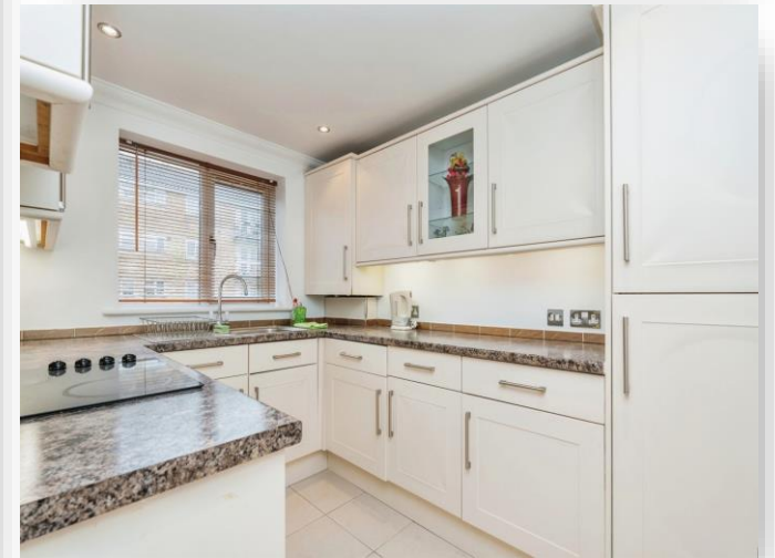
Forest Edge Rose Road, Totton Southampton SO40 9HT