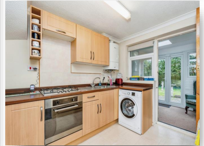
Priestley Close, Totton Southampton SO40 8TL