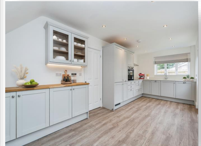
Fairfield Cooks Lane, Calmore Southampton SO40 2RU