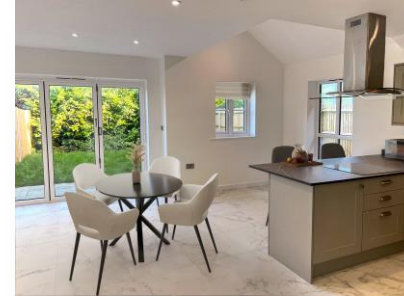
Hallway Kitchen/lounge/diner 16' 7" x 17' 4" ( 5.05m x 5.28m )