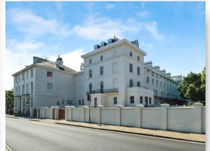
Portland Court Kent Road, Southsea PO5 3ES