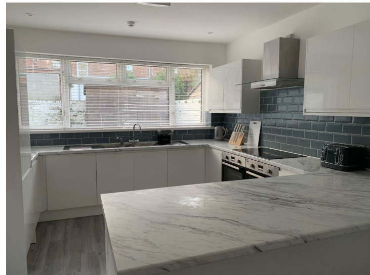
Victoria Road North, Southsea PO5 1PL