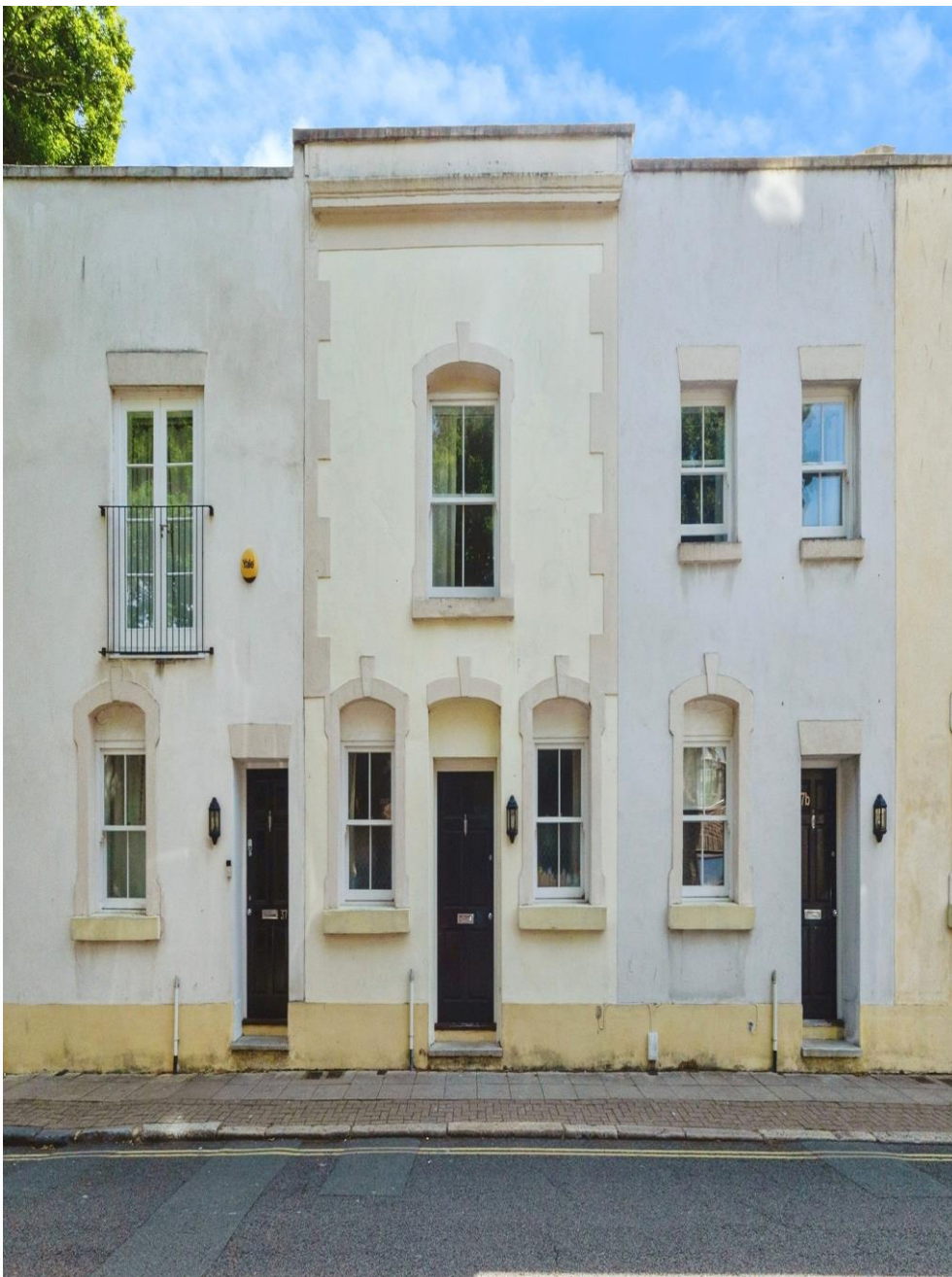
Eldon Street, Southsea PO5 4BS