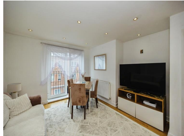
Elm Grove, Southsea PO5 1JF