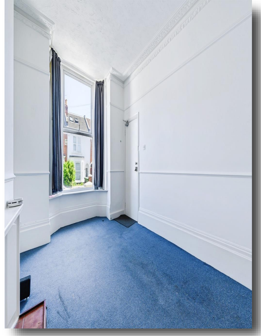
St. Andrews Road, Southsea PO5 1ES