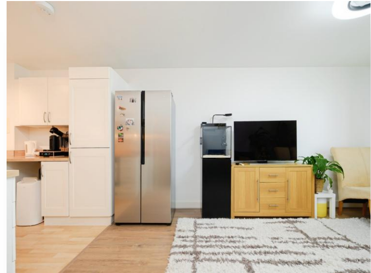
Vista Fratton Way, Southsea PO4 8FD