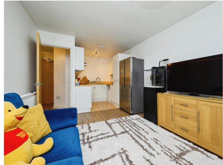
Vista Fratton Way, Southsea PO4 8FD