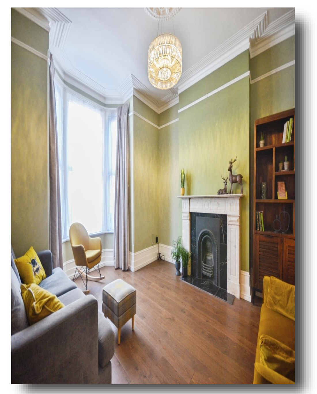
Auckland Road East, Southsea PO5 2HD