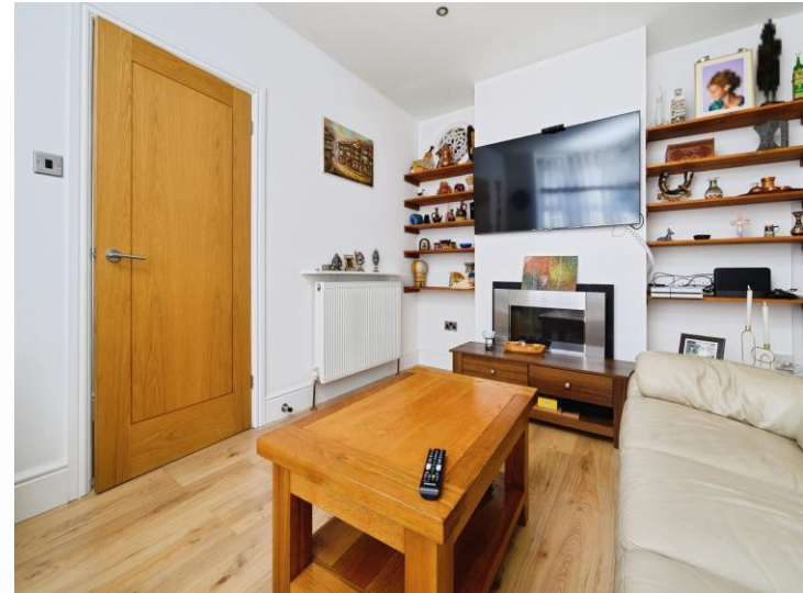
Eastfield Road, Southsea PO4 9EL