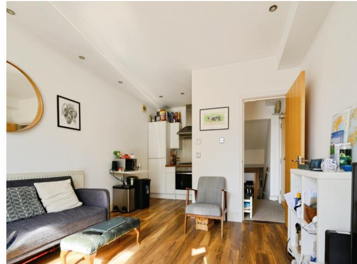
Jade Apartments Eastern Villas Road, Southsea PO4 0UU