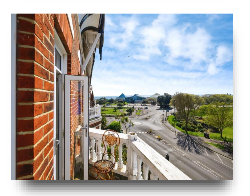
Lennox Mansions Clarence Parade, Southsea PO5 2HZ