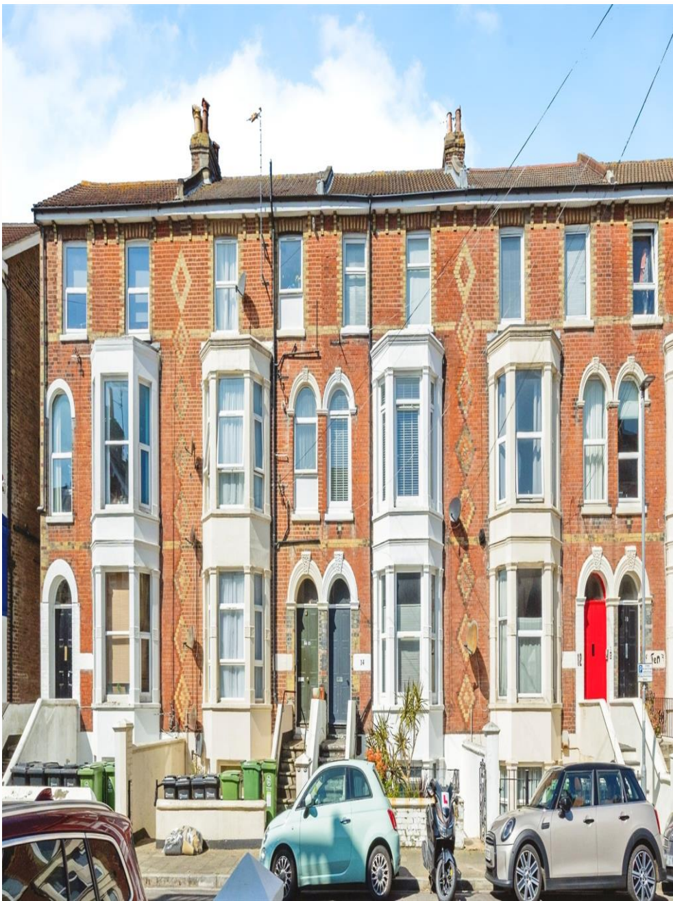
Elphinstone Road, Southsea PO5 3HR