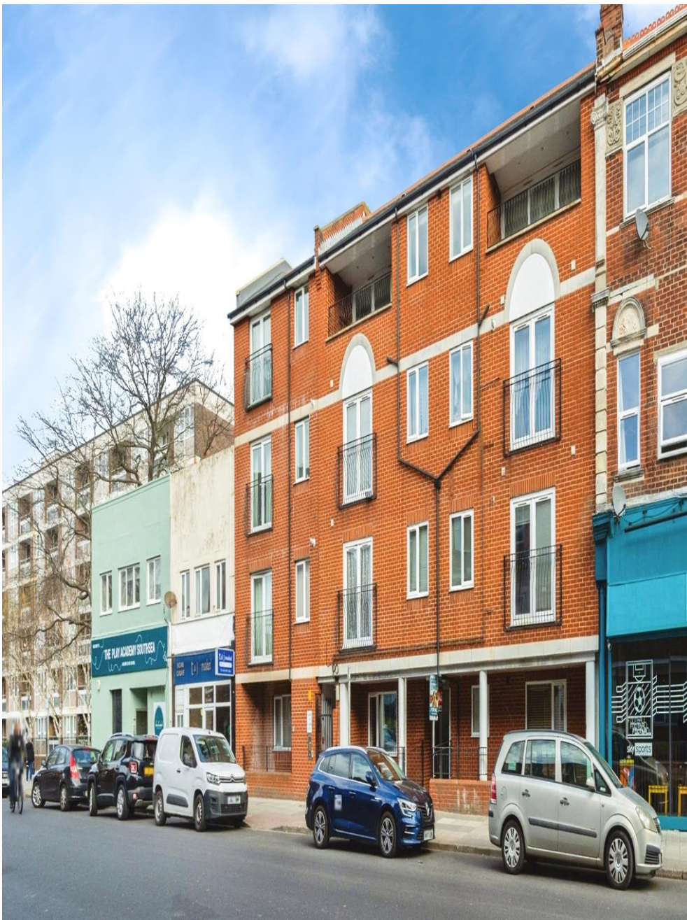
Elm Grove, Southsea PO5 1JF